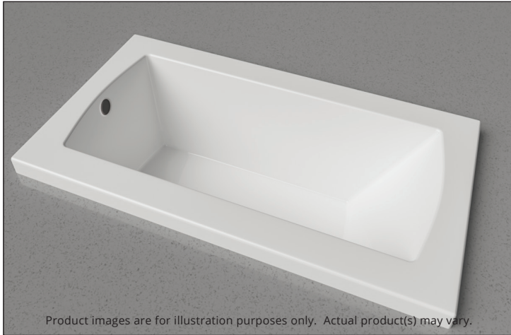
Product images are for illustration purposes only. Actual product(s) may vary.